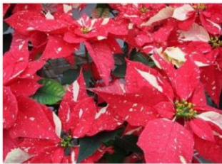
MULTI - "Jingle Bell"